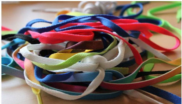
Examples of colorful shoelaces "Schnürsenkel in verschiedenen Farben", 1971Markus, 2011. Public Domain.