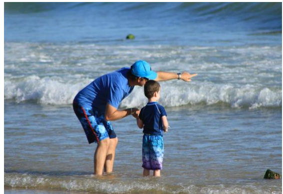
A parent models curious behavior Taniadimas, 2016. Used under Creative Commons CCo License.

Adapted from Boston Children's Museum (2016), “Family Tinker Kit: Everyday Tools for Play and Learning”, p. 11.