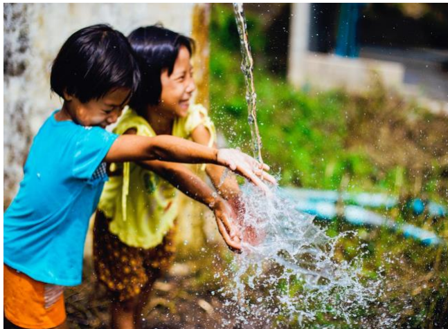
Children feel water on their hands.

Note: Make sure you use food coloring in the water so it is as visible as possible.