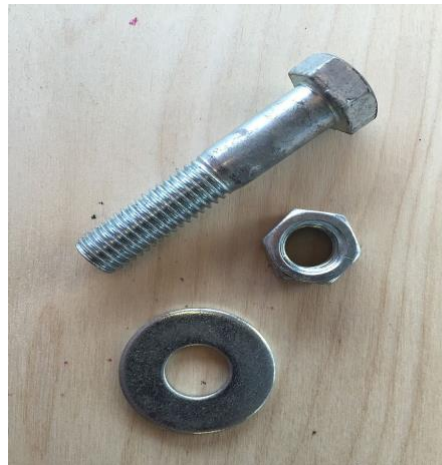
Nut, bolt, and washer, "connectors", S Brennan83, 2016. Used under Creative Commons Shared Attribution 4.0 International License.