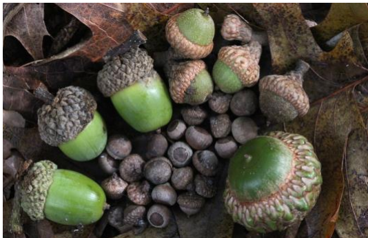
Acorns small to large, David Hill (2012). Used under the Creative Commons 2.0 Attribution Generic License.

When adventuring outside, look for and collect small natural materials that can be used for unstructured play! These materials encourage exploration of natural science and properties of nature.