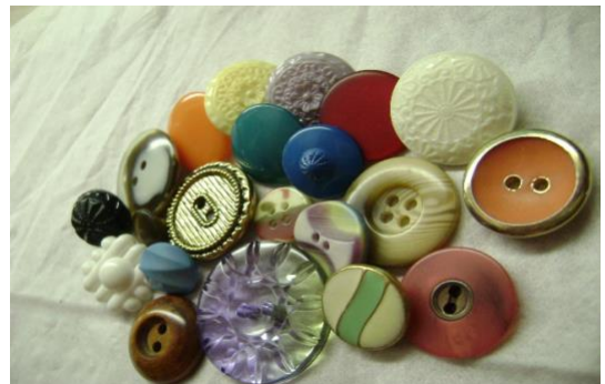
Vintage Sewing Buttons, SEMichel (2009). Used under the Creative Commons Attribution-Share Alike 3.0 Unported License.

Consider saving some of these items from your next trip to the grocery store or take a quick look around your home to see how many you already have.